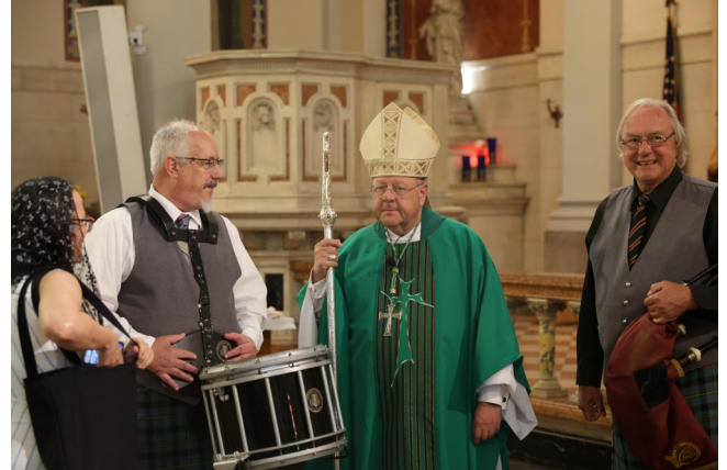
The musicians and singers were spectacular