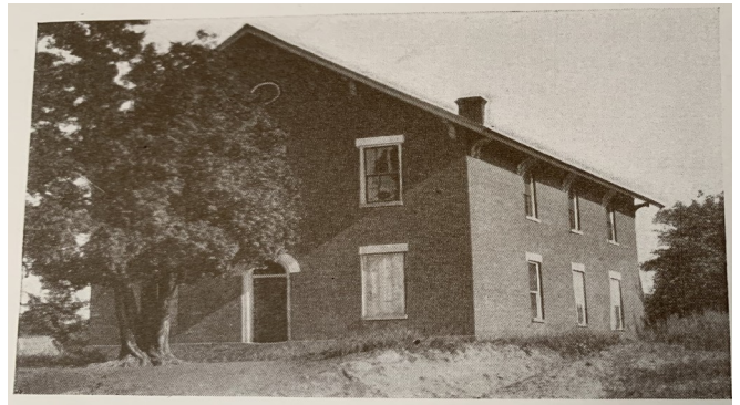
Exterior view of old Glenville Public School in which the first mass was celebrated in this District.

Who are we? Who am I? What is the world learning from watching us?