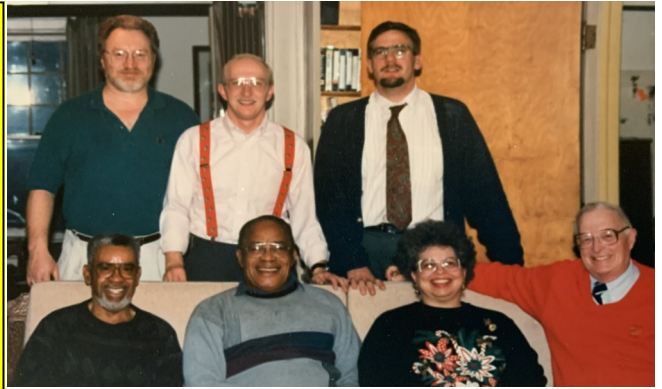
Can you name them all?