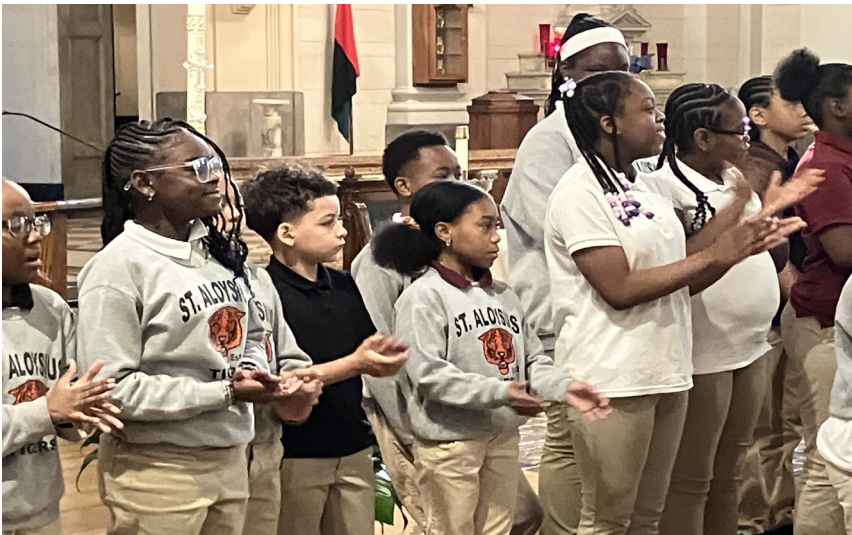
Current 3rd & 6th Graders