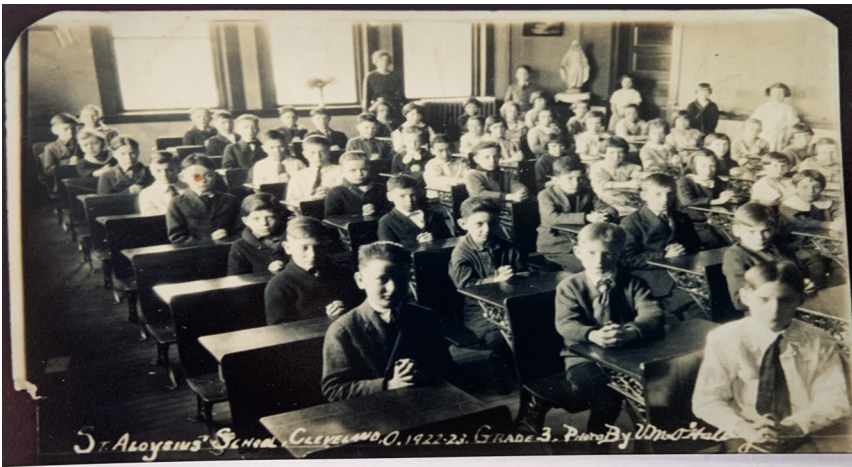
St. Aloysius School - 3rd Grade - 1922-1923