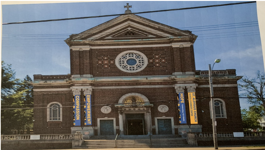
Present Church building at the corner of East 109 & St. Clair

10932 ST. CLAIR AVENUE CLEVELAND, OH 44108-1939 Parish House: 216-451-3262 • Fax: 216-268-3830 Office Hours: 8:00 a.m. - 1:00 p.m. (weekdays) Project H.O.P.E.: 216-391-7557 Parish Hall: 216-451-5908 Please call Parish House to include prayer intentions or announcements in Sunday Liturgy St. Aloysius—St Agatha School 640 Lakeview Road • Cleveland, Ohio 44108 Phone: 216-451-2050 • Fax: 216-541-1601 Monday thru Friday: 7:30 a.m.–3:00 p.m. St. Aloysius Preschool Phone: 216-451-4144