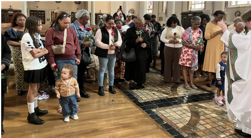
Mother's Day Blessing