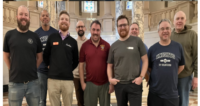
Knights of Columbus worked at St. Al's on Diocesan Service Day