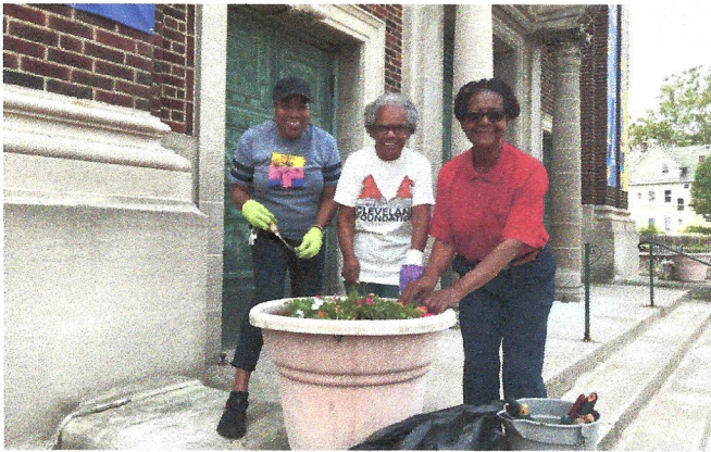
Three Garden Angels at Work