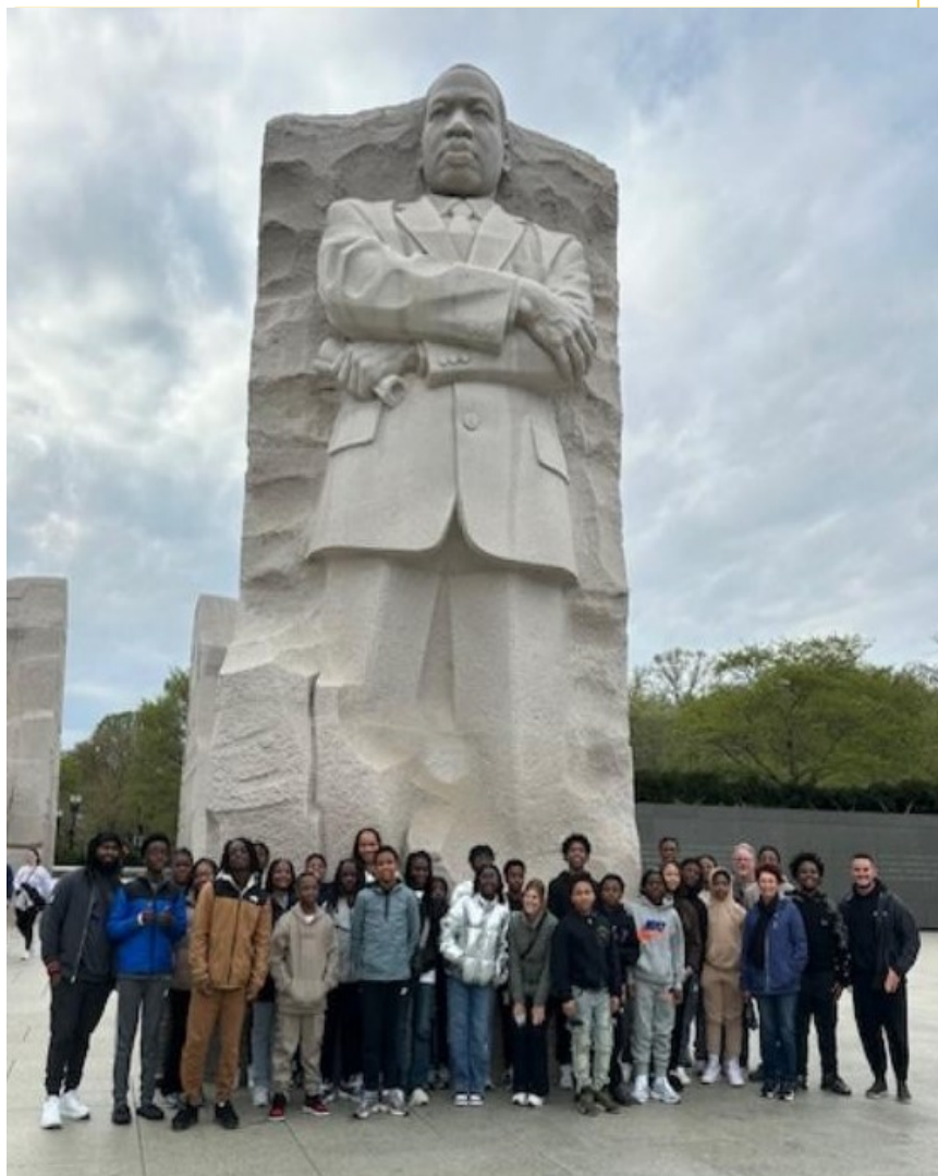
School Visits MLK Monument in Washington DC