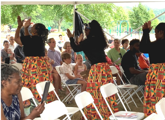
Juneteenth liturgical dancers