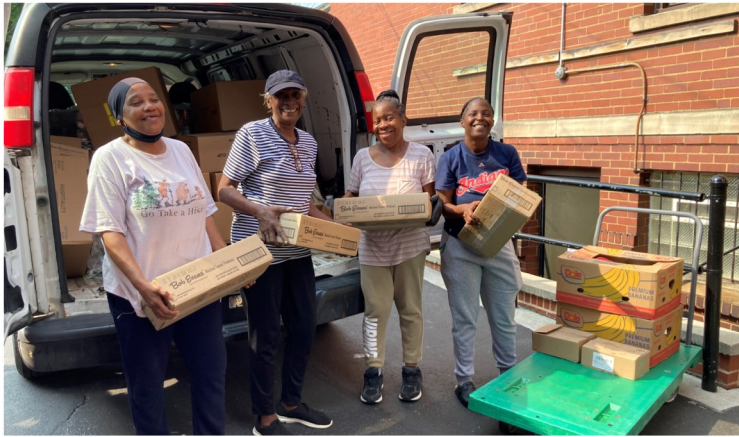
Unloading Hunger Center Van

Our parish family continues to grow and to make our presence felt in the Glenville neighborhood. Each week after Mass, we hold a demonstration for non-violence on the front steps of the church. We read the names of all those who have been victims of gun violence in the past week in our city and in our country. In seven years, there has been only one week that we have not had any names to read.