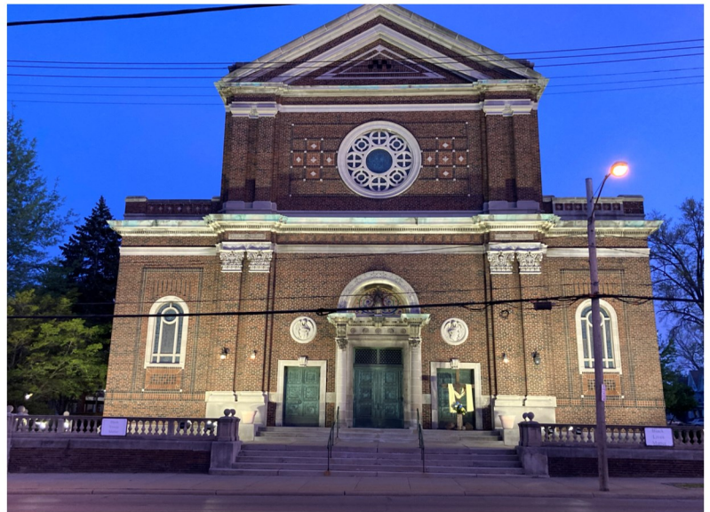
St. Aloysius - A Beacon of Hope in Glenville

Currently, the Ursuline Sisters of Cleveland and the Sisters of Charity Foundation are very generous in responding to our numerous grant requests for specific programs. The Catholic Community Foundation of the diocese also has us "on their radar" so to speak and steers donors to us whenever they can.