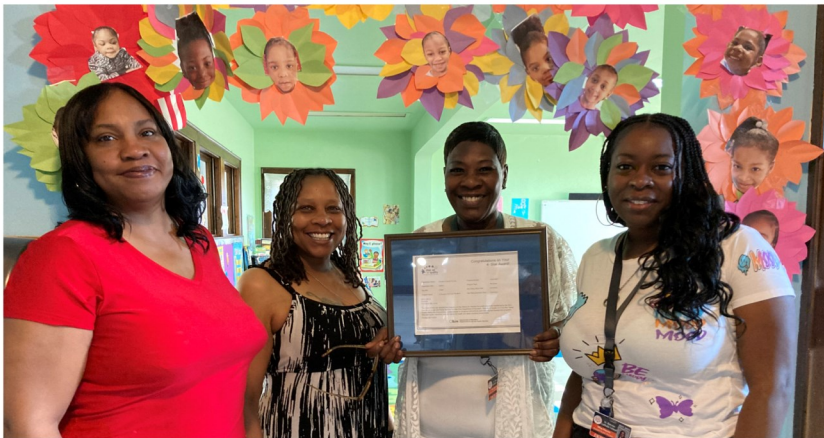
Preschool teachers celebrate 4 stars!

Students from our parish elementary school won third place in this year's diocesan STEM competition. St. Aloysius is one of the few urban Catholic schools that has a viable STEM program in place. This is a program that emphasizes the study of Science, Technology, Engineering, and Math across the curriculum. Our students created a water purification device entitled "The Bubbler Buddy". You might one day see it for sale at your favorite store.