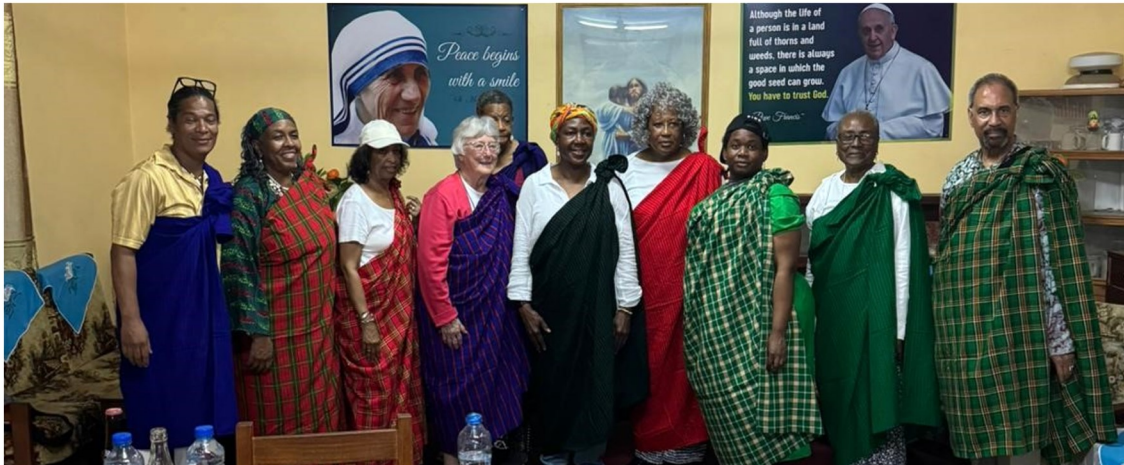
Four St. Aloysius parishioners were among the pilgrims who traveled to Tanzania. They are pictured here wearing their Masai robes.