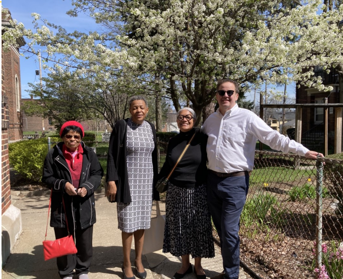
Enjoying a Spring Sunday at St. Al's