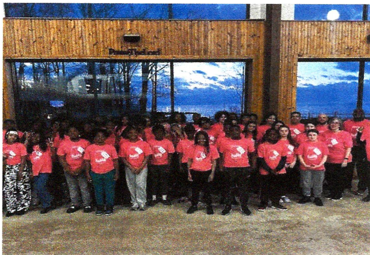
St. Aloysius School's Camp Fitch Trip