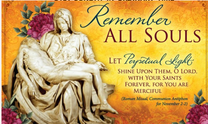
Remembering Our Loved Ones