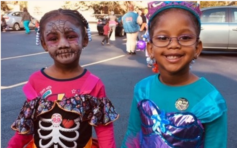
Young Participants at the Trunk & Treat Event