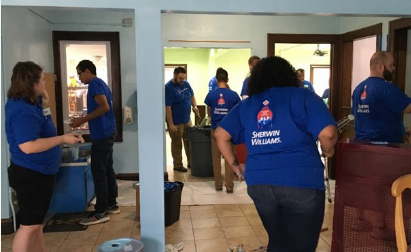
Sherwin Williams Volunteers Paint the Pre-School