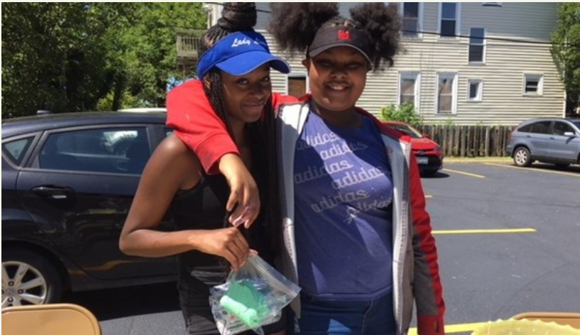
Fun at Annual Block Party

MISSION OF THE PARISH We are a welcoming Catholic Parish Embracing its African American culture, Empowering its members, And sharing its love of Christ Through service to the community.