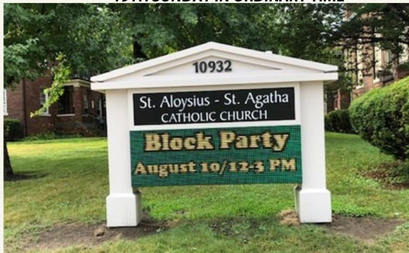
New Digital Sign