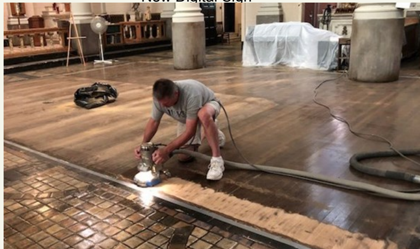
Church Floor Restoration Project