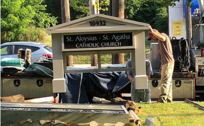
New Digital Sign Being Installed