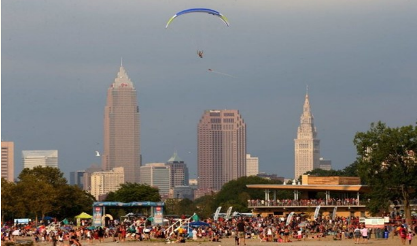
Summer in Cleveland!

MISSION OF THE PARISH We are a welcoming Catholic Parish Embracing its African American culture, Empowering its members, And sharing its love of Christ Through service to the community.