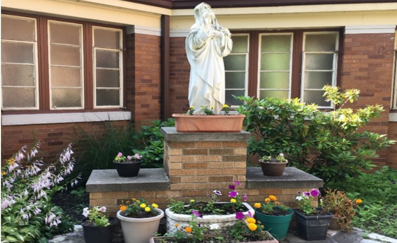
A Spot for Summer Reflection