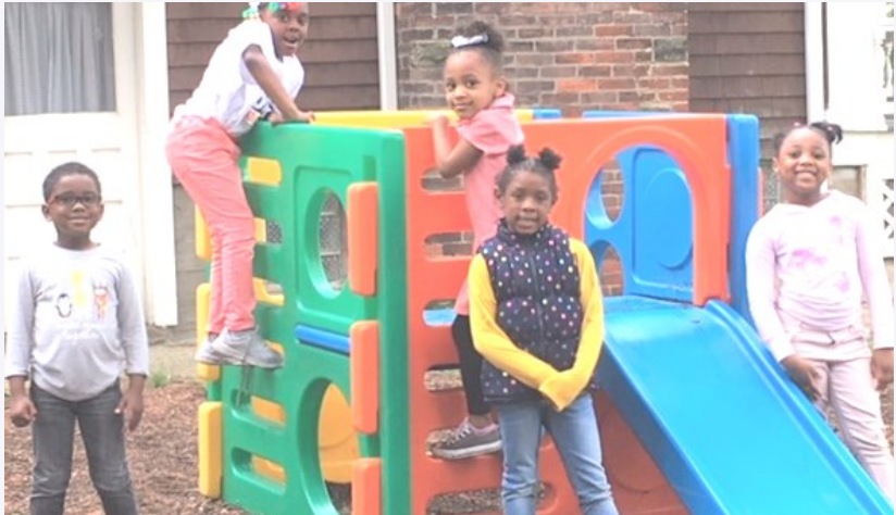
ST. AL' SUMMER SCHOOL FUN