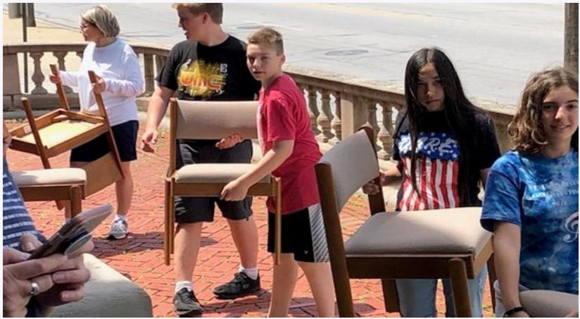
NEW CHURCH CHAIRS ARRIVE

MISSION OF THE PARISH We are a welcoming Catholic Parish Embracing its African American culture, Empowering its members, And sharing its love of Christ Through service to the community.