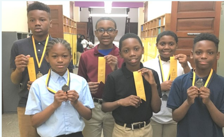
Boys Track Team Members with medals