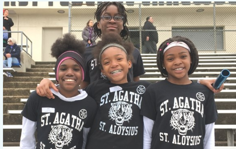
5th Grade Relay Team - 1st Place 5/4/19