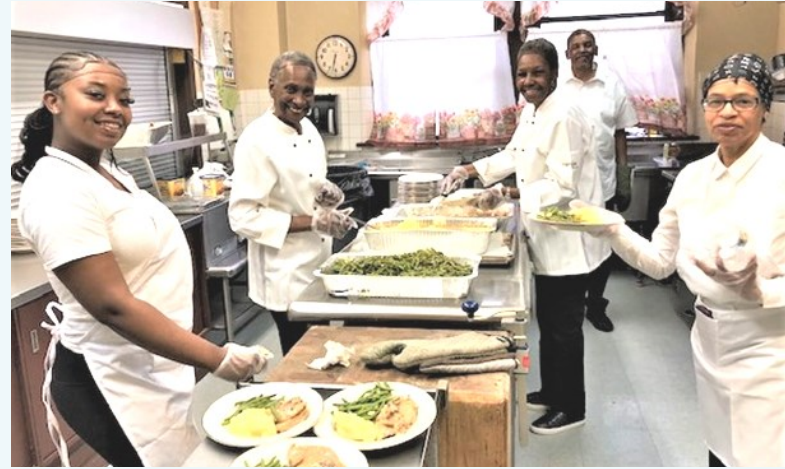
Kitchen Crew for Holy Thursday Dinner