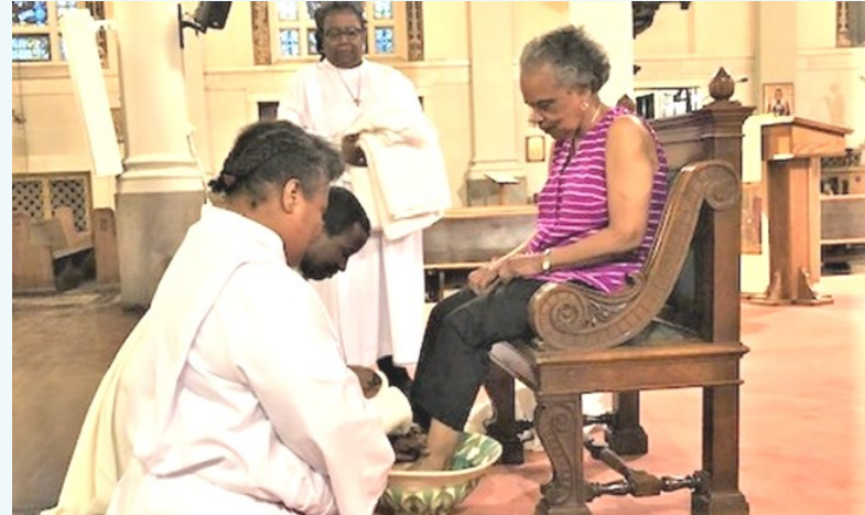
Holy Thursday Liturgy