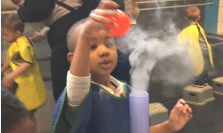
Preschool Field Trip to Children's Museum