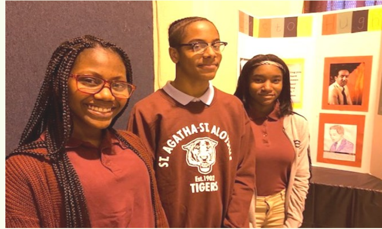
St. Aloysius Students Provide Hospitality