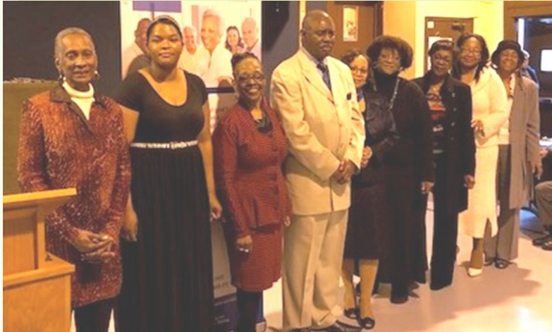
Navigators in Senior Outreach Program

10932 ST. CLAIR AVENUE CLEVELAND, OH 44108-1939 Parish House: 216-451-3262 • Fax: 216-268-3830 Office Hours: 8:00am–1:00pm (weekdays) Project H.O.P.E.: 216-391-7557 Parish Hall: 216-851-7611 Please call Parish House to include prayer intentions or announcements in Sunday Liturgy St. Aloysius—St. Agatha School 640 Lakeview Road Cleveland, Ohio 44108 Phone: 216-451-2050 • Fax: 216-541-1601 Monday thru Friday: 9:00am–3:00pm