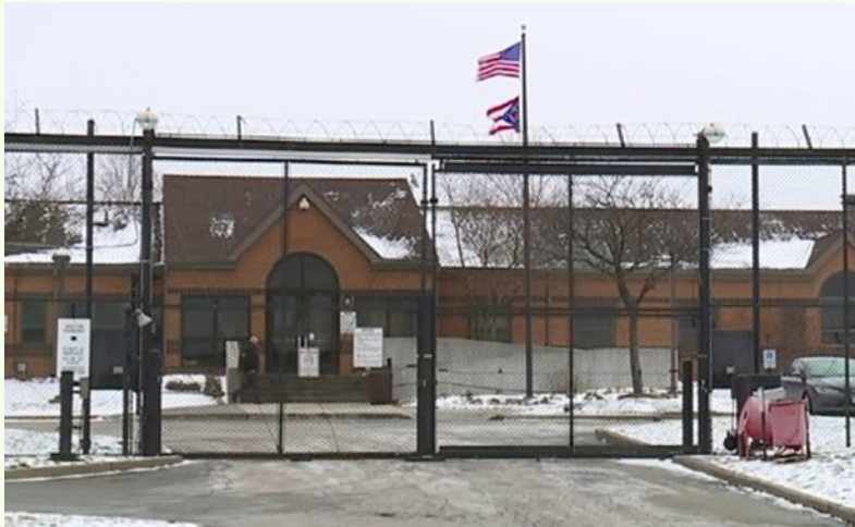
Remember the RCIA at Northeast Reintegration Ctr