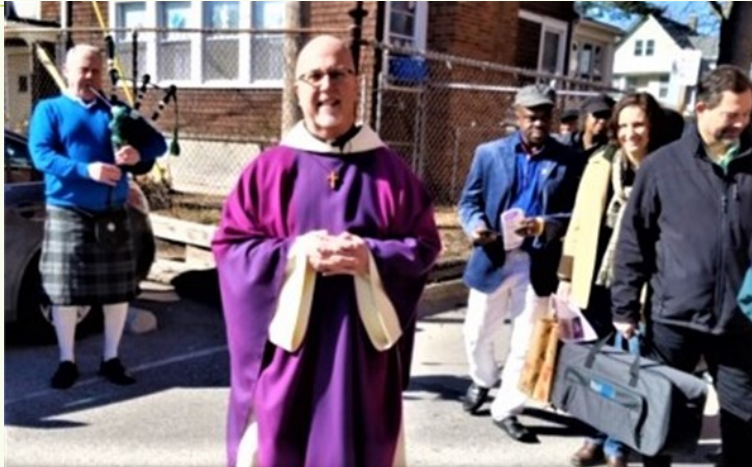
St. Aloysius has its own St. Patrick's Day Parade!