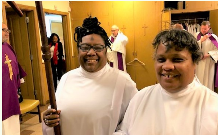
Serving at the Revival