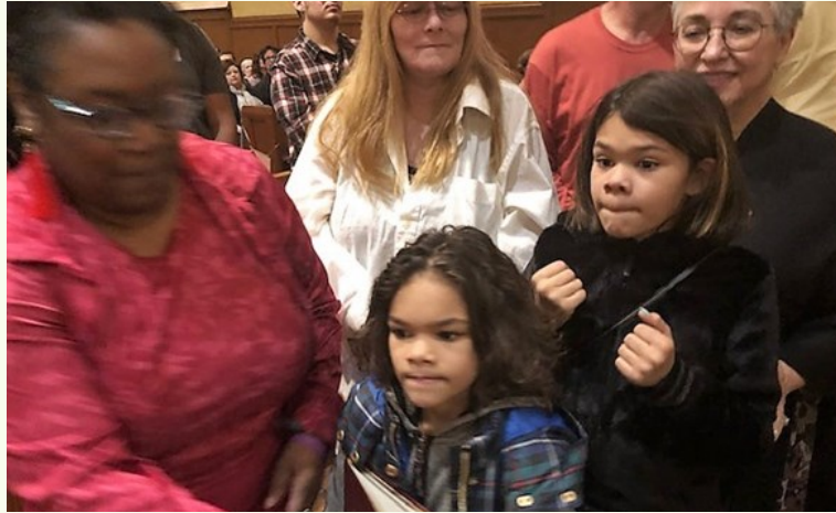
St. Aloysius Rite of Election