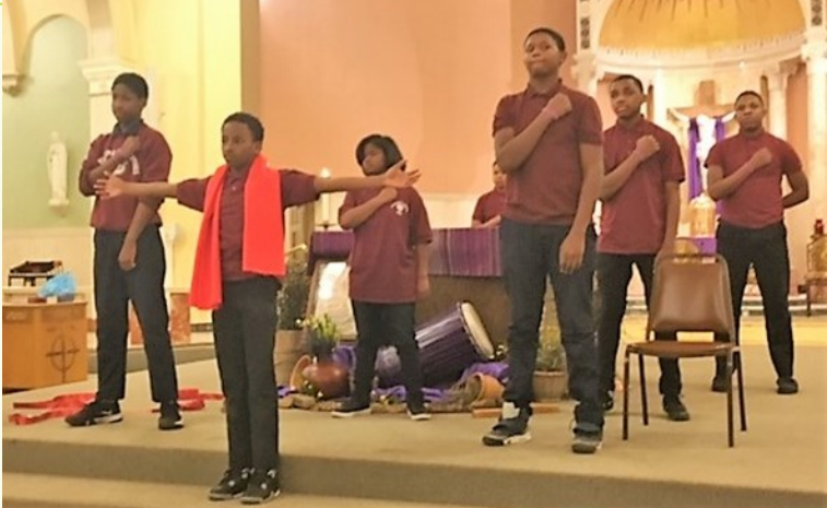
Eight Graders Perform Passion Mime at Revival