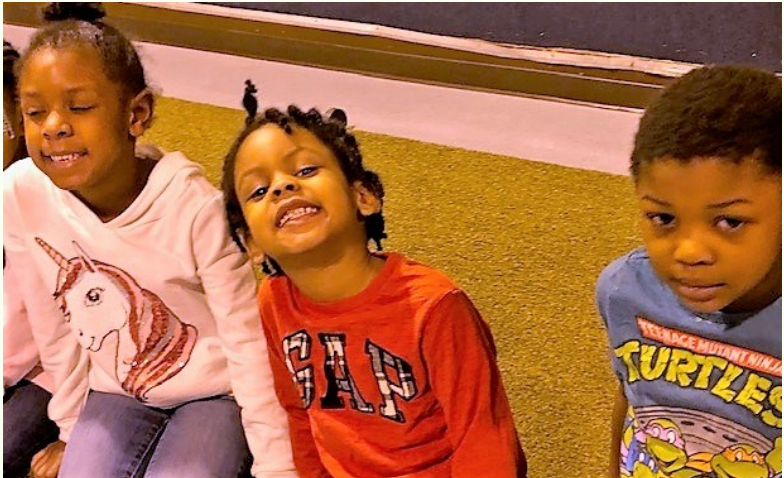
Grandparents' Day with the Pre-school