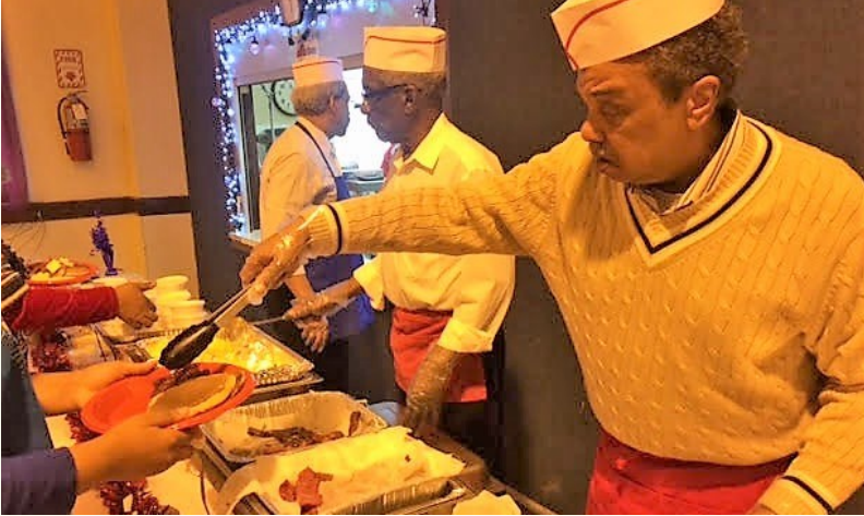
Men's Club Breakfast