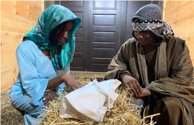
Live Nativity 2018