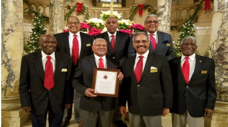
St. Aloysius Men's Club