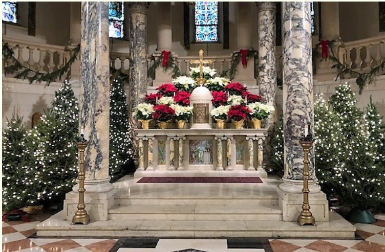
The Altar Decorated For Christmas