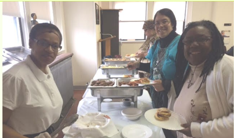
St. Vincent DePaul Breakfast with St. John Vianney