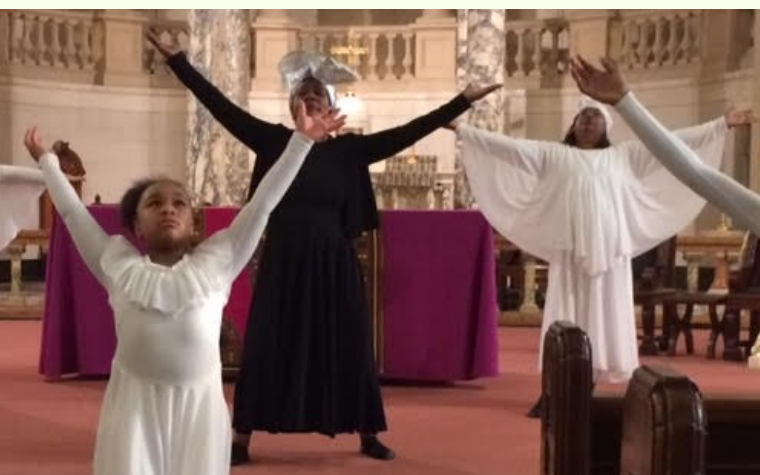
The Duffy Dancers Perform for Black History Event