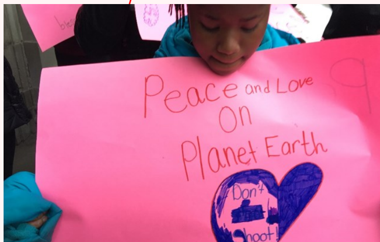
St Aloysius Demonstration Against Gun Violence 3/14