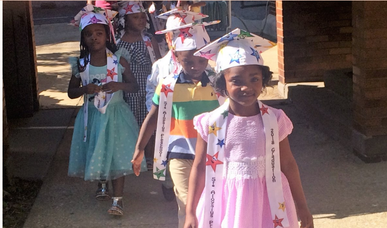
Preschool Graduation at St Al's (5/25)