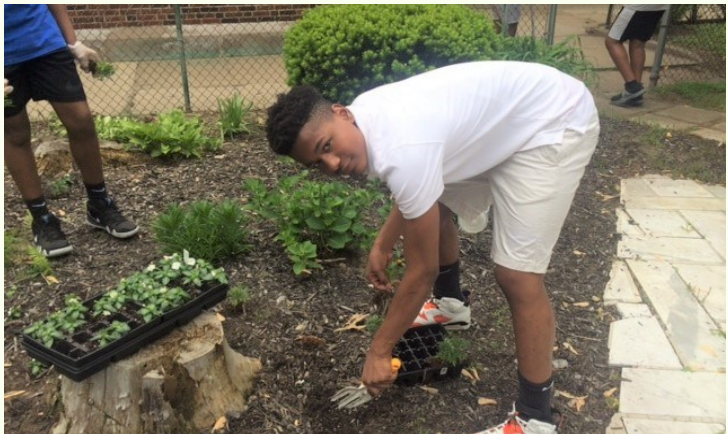
8th Graders Plant Flowers For the Summer

MISSION OF THE PARISH We are a welcoming Catholic Parish Embracing its African American culture, Empowering its members, And sharing its love of Christ Through service to the community.