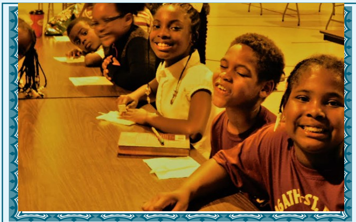
Happy children at St. Aloysius