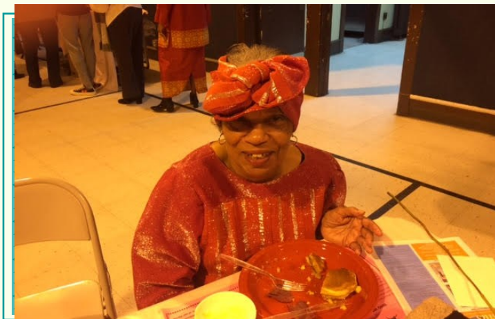
Traditional Dress for Black History Month