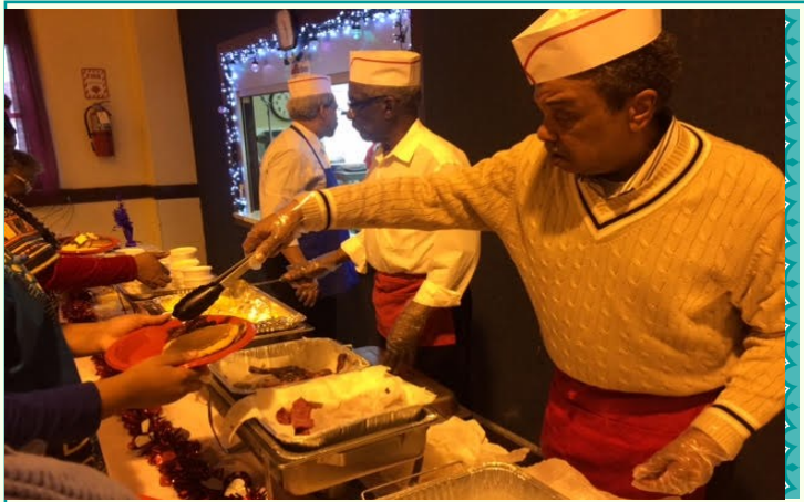
Men's Club Pancake Breakfast