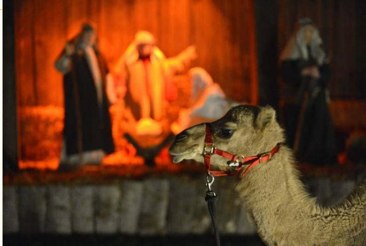
THIS THURSDAY DEC 20 FROM 6—8 PM