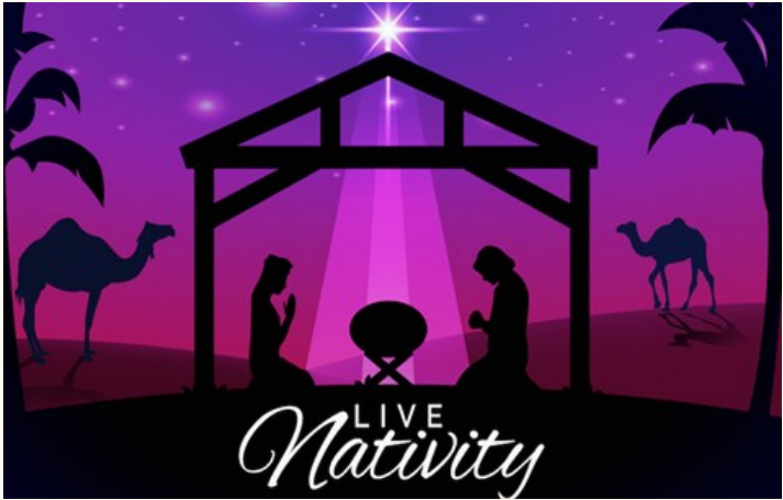
COMING DECEMBER 20th—6-8 PM

MISSION OF THE PARISH We are a welcoming Catholic Parish Embracing its African American culture, Empowering its members, And sharing its love of Christ Through service to the community.