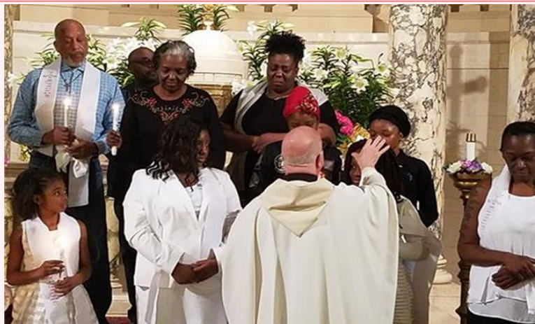
Newly Baptized are Confirmed—Holy Saturday