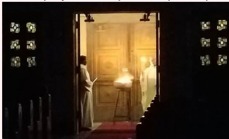
Blessing of the Fire—Holy Sunday