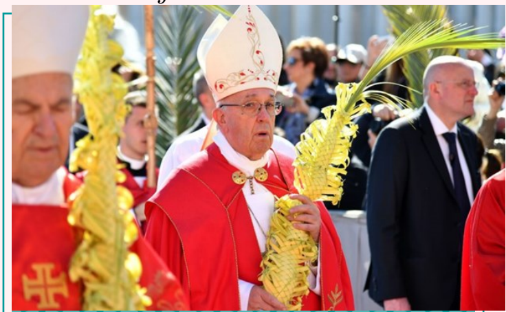
Pope Francis Celebrates Palm Sunday in Rome