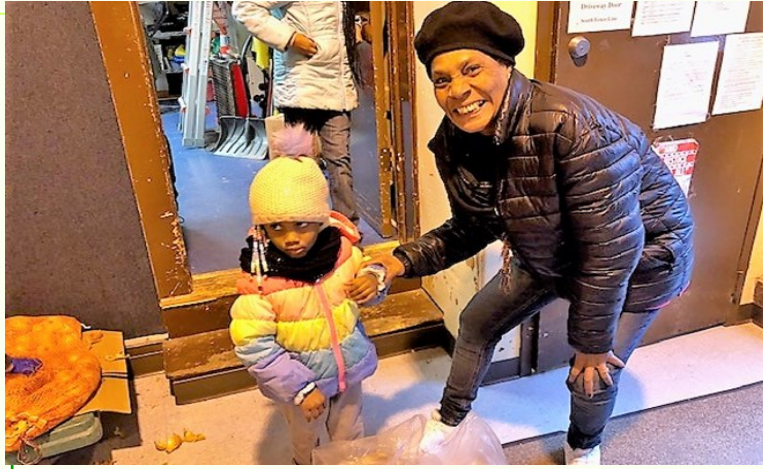
Happy Guests at Thanksgiving Pantry Distribution