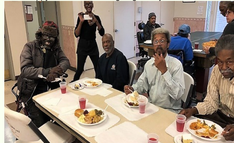
Thanksgiving Dinner at Mt. Auburn Residence

10932 ST. CLAIR AVENUE CLEVELAND, OH 44108-1939 Parish House: 216-451-3262 • Fax: 216-268-3830 Office Hours: 8:00am–1:00pm (weekdays) Project H.O.P.E.: 216-391-7557 Parish Hall: 216-851-7611 Please call Parish House to include prayer intentions or announcements in Sunday Liturgy